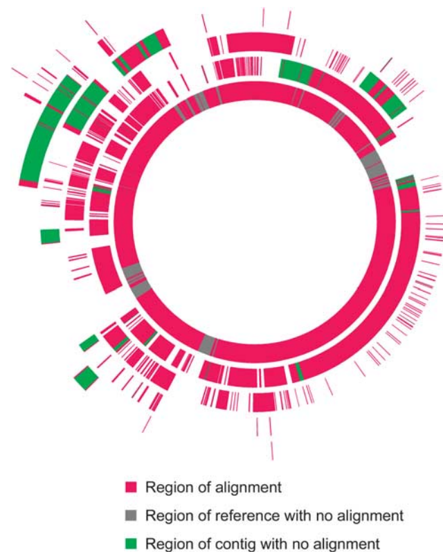
Figure 1 Alignment of ANAS metagenome Dhc contigs (identified by TF and/or SS) to the Dhc strain 195 genome. The inner circle represents the reference strain 195 genome, with the origin of replication at the top. Magenta areas indicate alignment to ANAS metagenome contigs, whereas gray areas indicate regions with no alignment. Each contiguous bar in the outer circles represents a contig, positioned based on its aligning regions, with contigs plotted on different circles to avoid overlap. Green areas indicate regions with no alignment to the reference genome, potentially containing novel Dhc genes (if they also do not align to other Dhc reference genomes).

The corrin ring synthesis genes are on contig ANASEMC_C6240, which was identified as Dhc by