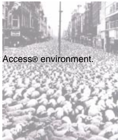
Microsoft Access® environment.

We recognize that some sort of mass storage is a necessity. Mass storage provides a common and total molecularity from which all construction disciplines can benefit. In a fashion this is what makes the Data Island so interesting: we no longer think of information residing in databases or tables or rows or columns. Instead we envision data simply existing somewhere. This is not a neat and tidy (and basically useless) Microsoft Access® environment. This is about an idea that is approaching cyberspace and total manipulability. This is space- absolutely imaginary, absolutely virtual yet, at the same time, a completely measurable, absolute reality. We have the tools to create references to data and then to create inter-relations that make multiple structures take on manifold meanings. This is how information becomes extra-contextual and immediately relevant to other disciplines. The more molecules the better.